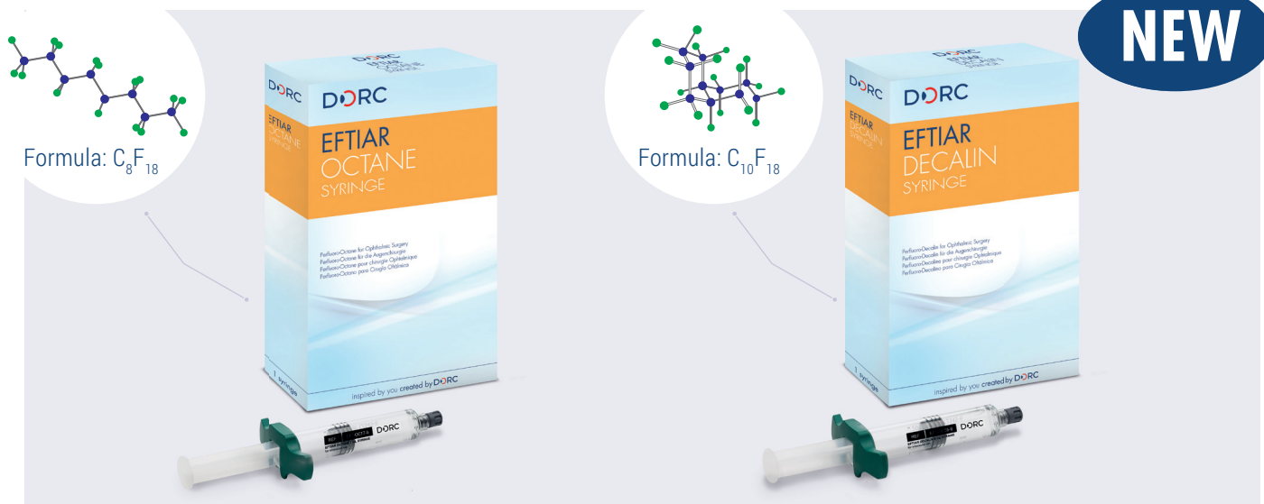
EFT-OCT5-S EFTIAR Octane 5ml syringe (Box/1, Sterile).