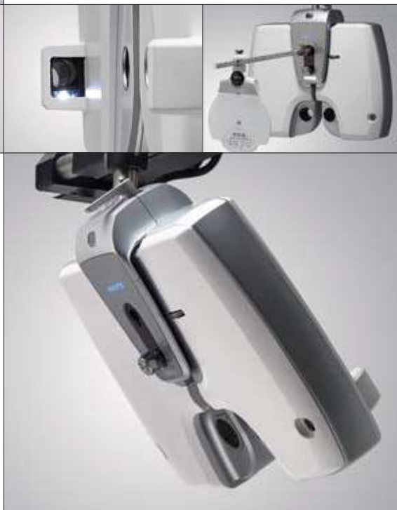
Tiltable Refractor Body