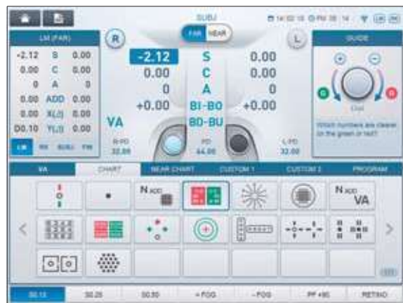
Various Charts / Real Time Guide