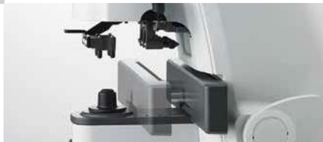
Minimize the Distance between PD Bar and Lens Support

Able to measure small-sized progressive multifocal and bifocal lens as well as exquisitely measuring the power of near position.