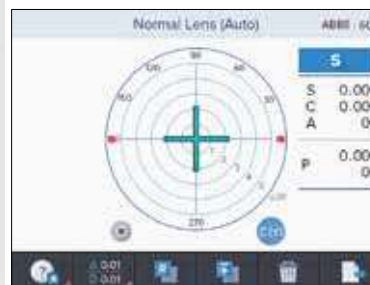
Auto Lens Recognition

New bright and easily visible Graphical User Interface(GUI) that gives feedback and guidance for easy-to-use operation.