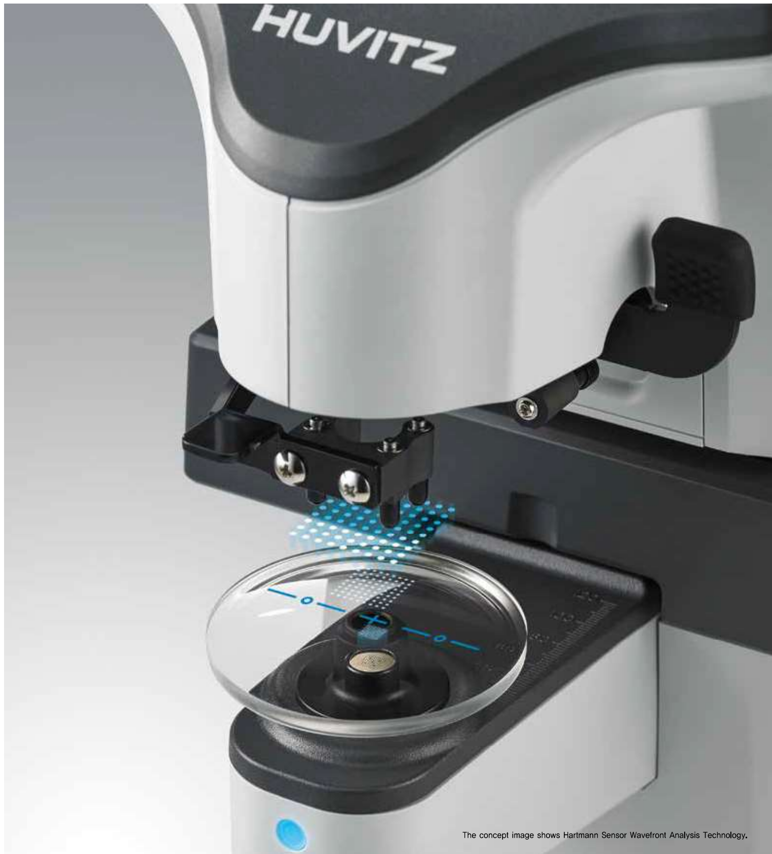
The concept image shows Hartmann Sensor Wavefront Analysis Technology.

Our New Generation of Lensmeter with the Hartmann Sensor Wavefront Analysis Technology