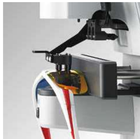
Mirror Lens Measurement