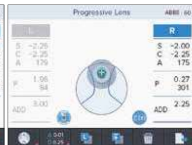
Progressive Lens Measurement