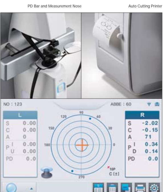
User-friendly Graphic Interface