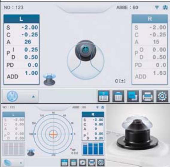
Contact Lens Measurement