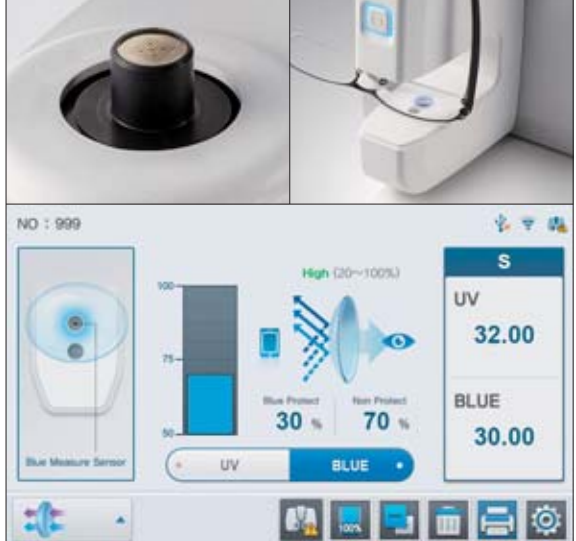
Blue Light Hazard and UV Measurement