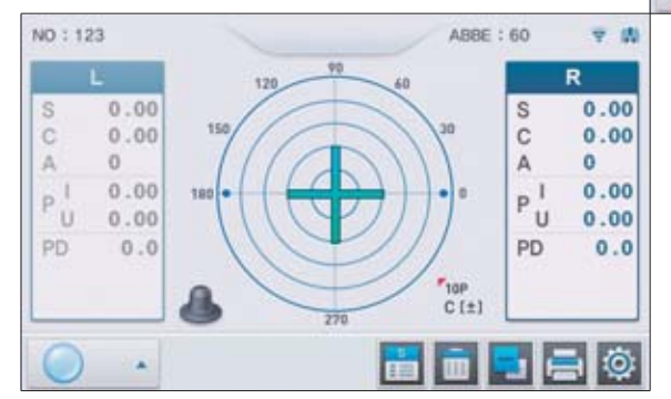
Intuitive Prism Direction

Classic communication via RS-232 cable is available for data transmission with previous models.