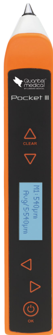
1:1 scale picture